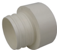
3" Corrugated Pipe to 4" SDR 35 Socket PL-90860-A43