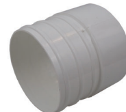
4" Corrugated Pipe to 4" SDR 35 Socket PL-90860-V44