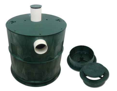
Flow Gate (overflow release) Part #: PDB-4PE-GN