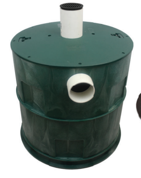
4" Surface Drain Grate Part #: PDB-4G-BK (Black)