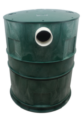
24" x 6" Riser Part #: 3008