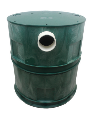
24" x 3" Riser Part #: 3008-RP