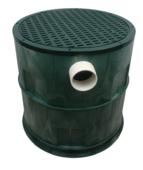
24" Heavy Duty Grate Part #: 3008-G24