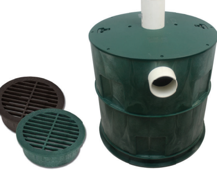
4" Surface Drain Grate Part #: PDB-4G-GN (Green)