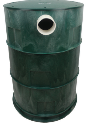
24" x 12" Riser Part #: 3008-R12