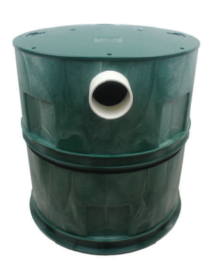
24" x 2" Riser Part #: 3008-GR2