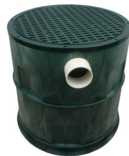
24" Heavy Duty Grate Part #: 3008-G24