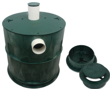
Flow Gate (overflow release) Part #: PDB-4PE-GN