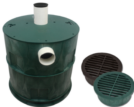
4" Surface Drain Grate Part #: PDB-4G-BK (Black)