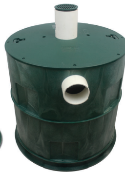
4" Surface Drain Grate Part #: PDB-4G-GN (Green)