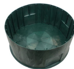
24" Basin Part #: 3008-R12B