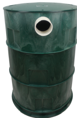
24" x 12" Riser Part #: 3008-R12