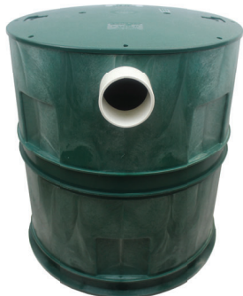
24" x 3" Riser Part #: 3008-RP