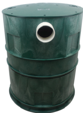
24" x 6" Riser Part #: 3008